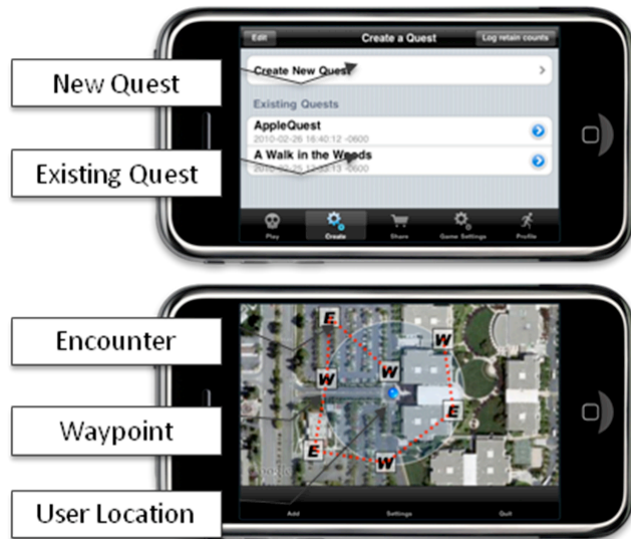
Figure 2: Quest and map creation views

actually walking the desired path. The main quest edit page and primary map editing view are shown in Figure 2.